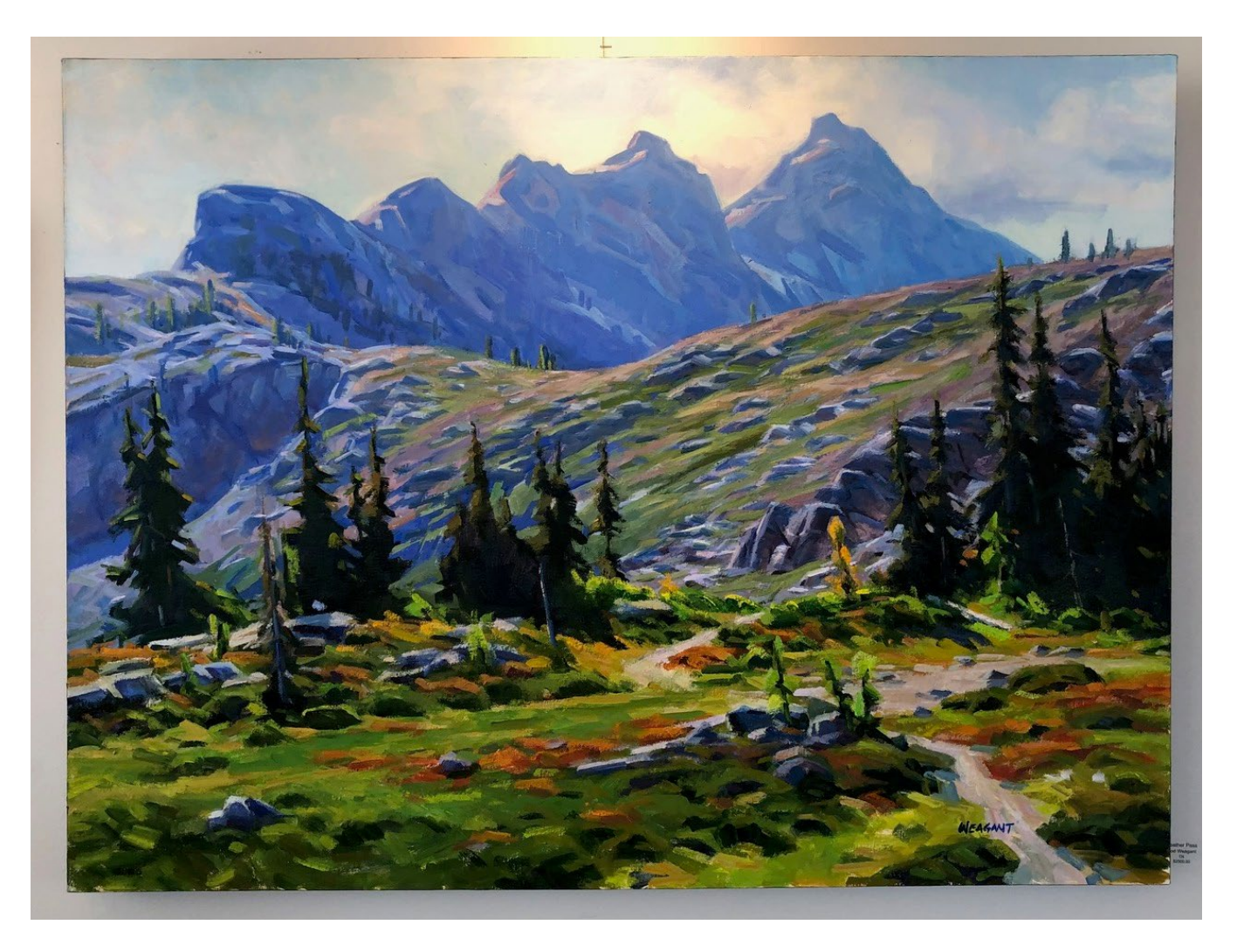
Sold! "Heather Meadows" was sold just after closing time Thursday night.