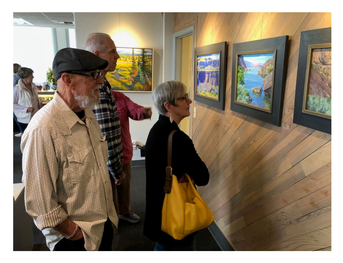
We had many people flowing into the gallery this evening, even with other activities of the Washington State Apple Blossom Festival taking place in Wenatchee this weekend.